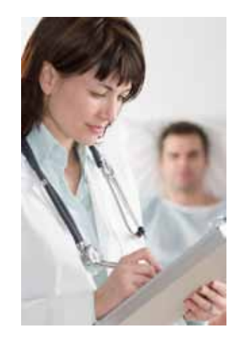
For tips on how to keep your claim on track, see page 15. See also Chapter 9. For More Information & Help.