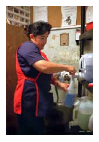
For tips on how to keep your claim on track, see page 15. See also Chapter 9. For More Information & Help.

After a job injury, staying at work or returning to work safely and promptly can help in your recovery. It can also help you avoid financial losses from being off work. This chapter describes how you can continue working for your employer.