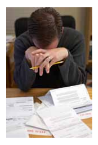
For tips on how to keep your claim on track, see page 15.